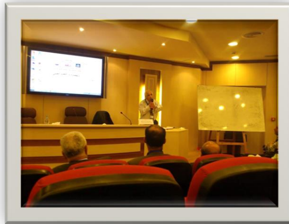
A speaker makes a point at Alexandria University's 2nd International Conference of Statistics.