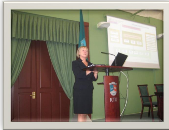
A speaker talks at the Lithuania celebration of the International Year of Statistics.

of Statistics Lithuania. There also was an exposition of publications from Statistics Lithuania and the KTU library dedicated to official statistics and statistical science, the Official Statistics Portal and its possibilities, and an interactive educational tool for pupils— E.school created by Statistics Lithuania. The seminar drew the widespread attention of students.