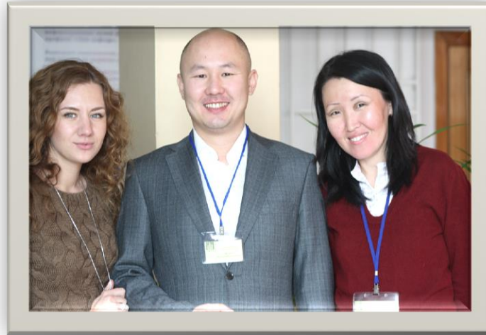
Three participants at East Siberia State University's international scientific-practical conference smile for the camera.

Potential in Modern Information Society.” Sixty-five attendees from universities in Kazakhstan, China, Mongolia, Moscow, Tomsk, Orenburg, Novosibirsk, Joshkar-Ola, Irtutsk, Yakutsk and Ulan-Ude participated in the week and the conference. Following the conference, the university published a book that included submitted articles as well as a letter of support from Statistics2013.