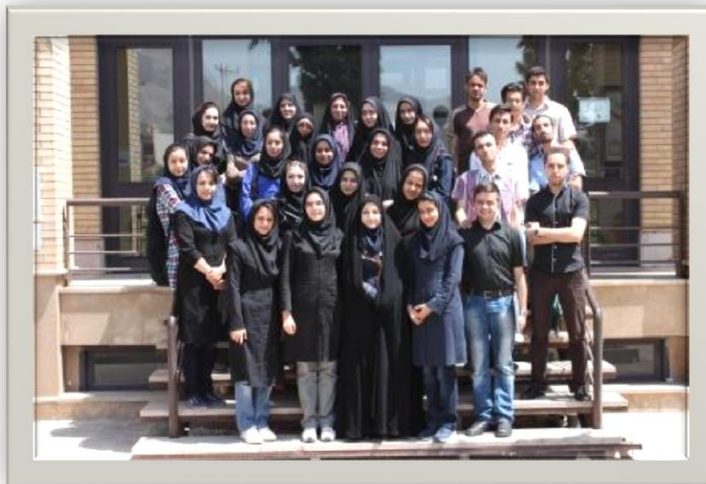
Isfahan Mathematics House Statistical Summer School attendees pose for a group photo.