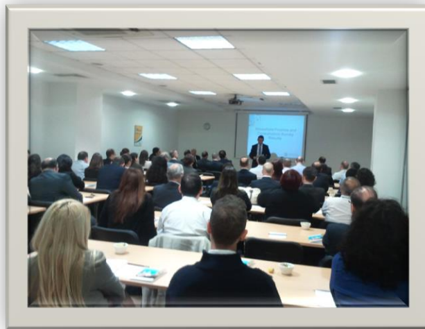
A roomful of attendees turned out for NSO Malta's Statistical Literacy Seminar.