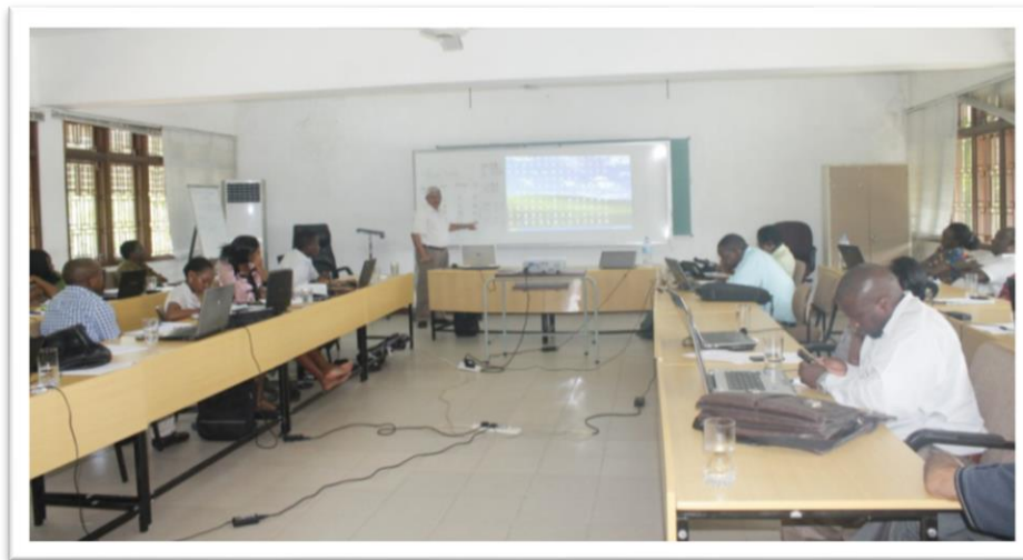
Students learn about official statistics at the Eastern Africa Statistical Training Centre in Dar es Salaam.

In April 1978, the Statistical Training Programme for Africa (STPA), under UNECA, requested the Tanzania government to run the STC. The Centre remains regional and has expanded to serve more states in Eastern and Southern Africa in addition to the partners of the former EAC.