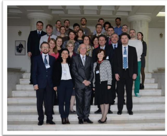
“R-omanian” R team workshop participants pose for a group photo.

pioneers of R from other national statistical offices. The R-omanian R team and the workshop organizers—the National Institute of Statistics, National Centre for Training in Statistics, Bucharest University of Economic Studies, Ecological University of Bucharest, and Nicolae Titulescu University of Bucharest—thank all participants for sharing their experience and knowledge.