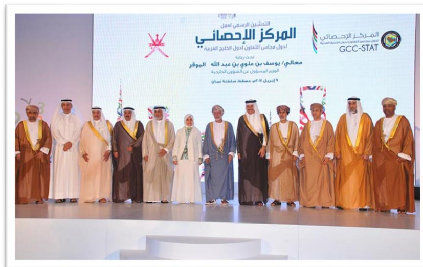
Representatives of member states gather for the launch of the GCC Statistical Center in Muscat, Oman.

The Ministry also participated in an exhibition held as part of the ceremony. The GCC exhibit shared reports and bulletins issued by member states. Qatar exhibited various resources, including an atlas of the country, a booklet of the nation in numbers, reports on marriage and divorce, a cultural statistics report, and other miscellaneous reports.