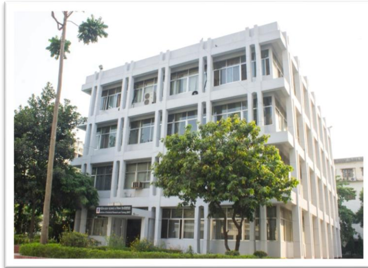
The Institute of Statistical Research and Training (ISRT) at the University of Dhaka, Bangladesh